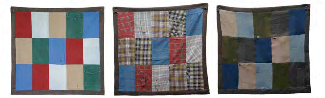
Details of 'Work pants, shirts, socks' - shirts and socks panels